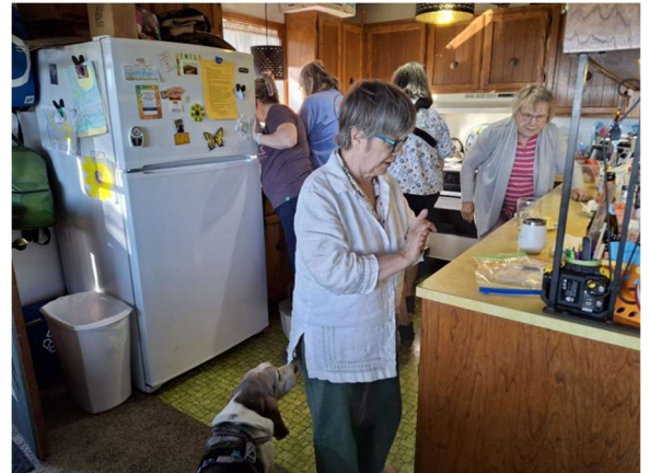
There are never too many cooks in the kitchen.

We have heard that the KPC men feel left out. Maybe they should plan a retreat at JODA.