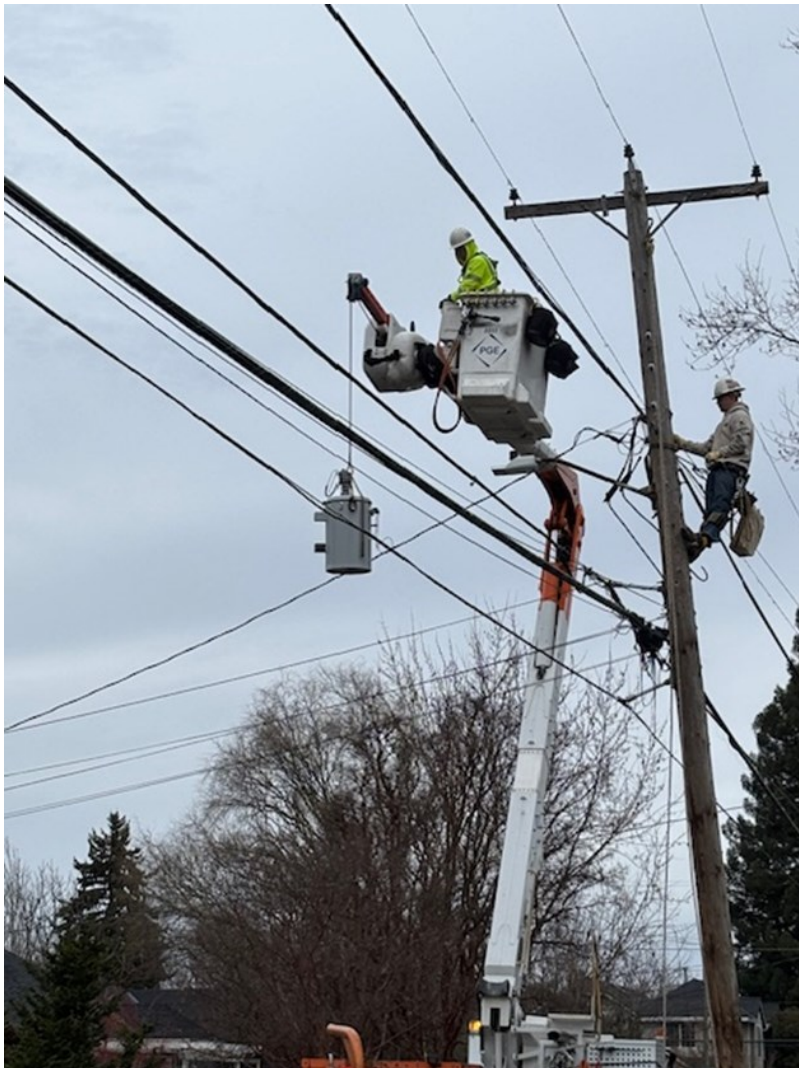
PGE installing a larger transformer.