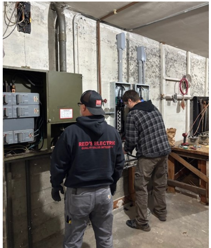
Red's Electric switching the electrical service from the old panel to the new ones.