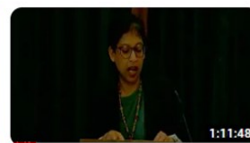
Sunday morning worship 8/08/2023