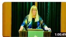
Sunday morning worship 8/13/2023