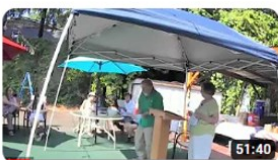
Sunday morning Worship in the Woods