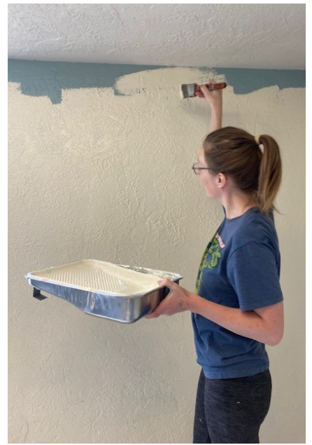
Kenilworth Community Preschool parents trimming up the play yard and giving a fresh coat of paint to a top floor space.

Kenilworth Presbyterian Church 4028 SE 34th Ave Portland, Oregon 97202 503-235-3977